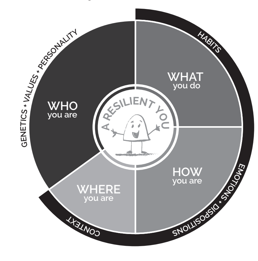
Figure I.2 The Resilience Pie

This book is anchored in a four-part conceptual framework, based on the key components of resilience and how it is developed. The four parts are who we are, where we are, what we do , and how we are. Figure I.2 represents this framework.